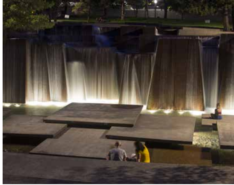
Portland Open Space Sequence Restoration Ira Keller Fountain

PRIORITY PROGRAMMING. Active planning is underway to bring attention to the parks and streetscapes as stages for civic life including community markets, fairs, festivals, concerts and pageants. Working closely with arts and cultural partners to program events and activities, we are working to create a diverse and thriving year-round vibrant district.