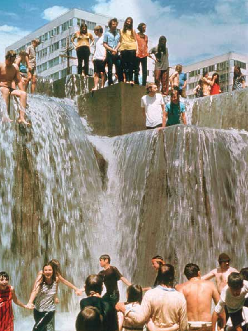
June 1970 Opening Fourcourt (Ira Keller) Fountain