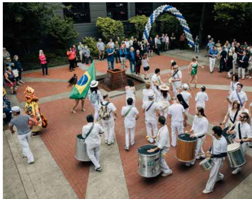
The Big Splash Celebration Source Fountain