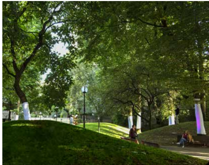
'Changing Places' Halprin Installations Pettygrove Park